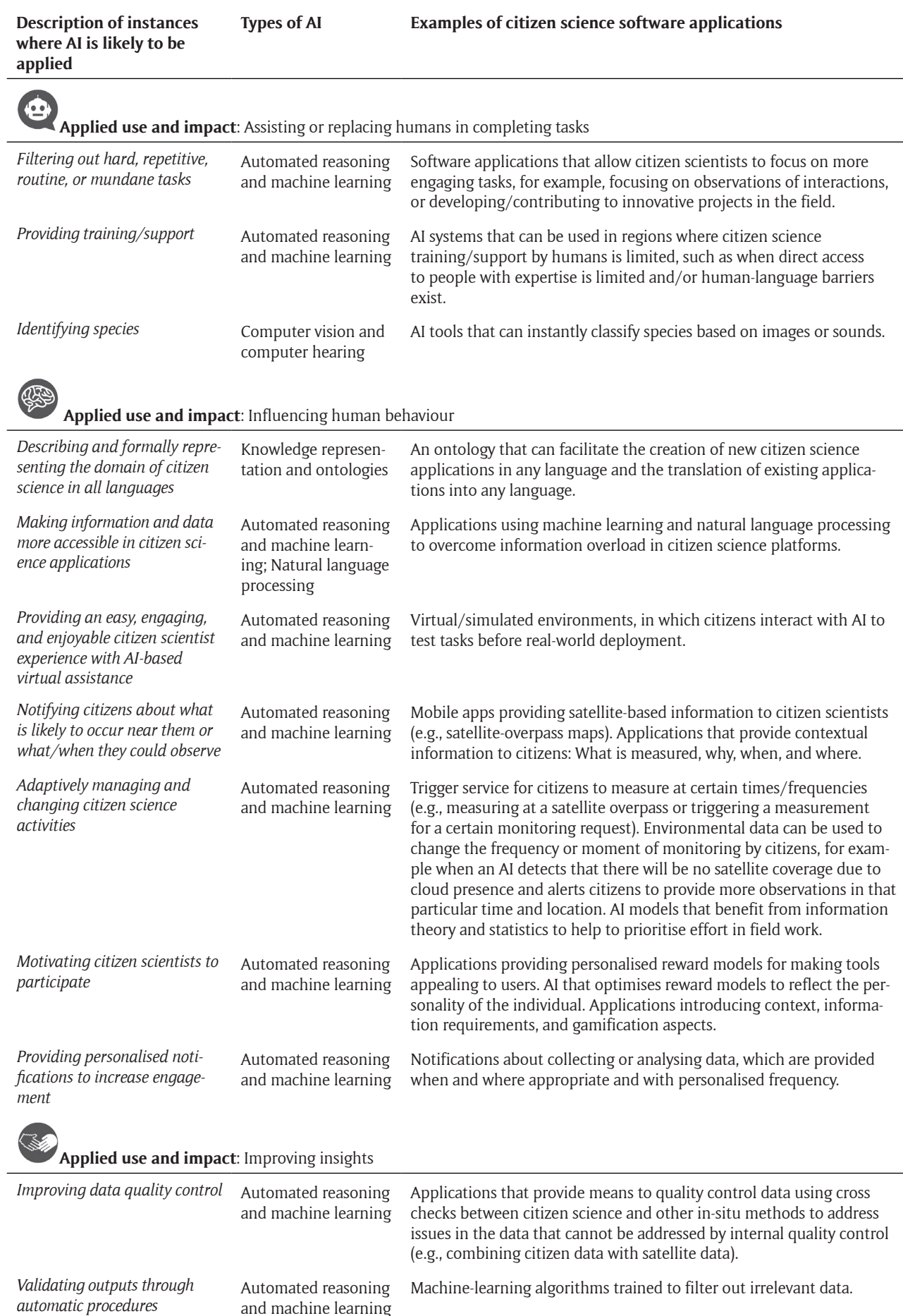
Table 2: Summary of new applications of AI in citizen science likely to appear in the near future.