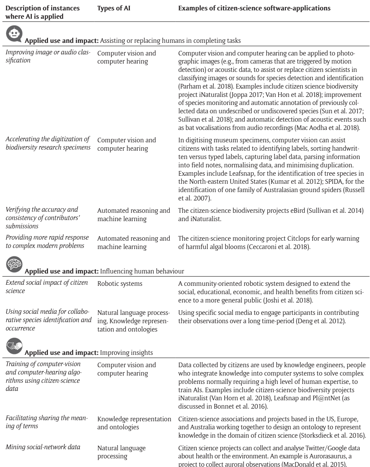
Table 1: Summary of the categories of AI used in citizen science and their applications. (The list of categories is not ranked in terms of importance.)

and plants in our environment, without the need for human-based methods of classification. In this case, not only is AI a tool to engage citizens, it also opens the possibility of creating new applications based on automatic nature classification.