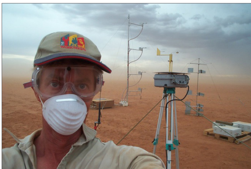
In 2015 ACSA members wrote an “Occasional Paper on Citizen Science” released by Australia’s Chief Scientist at the country’s inaugural citizen science conference in Canberra. The publication highlighted projects such as DustWatch, whose volunteers monitor storm activity using instruments such as DustTraks®.

In this landscape of global project collaborations, associations are working in concerted ways to increase the capacity and credibility of the larger citizen science community and field worldwide. This mimics similar efforts by the scientific community at large where national organizations are highly linked in international networks and communities to address common issues. Establishing similar collaborations among associations in the field of citizen science can serve to amplify regional efforts without de-emphasizing regional concerns.