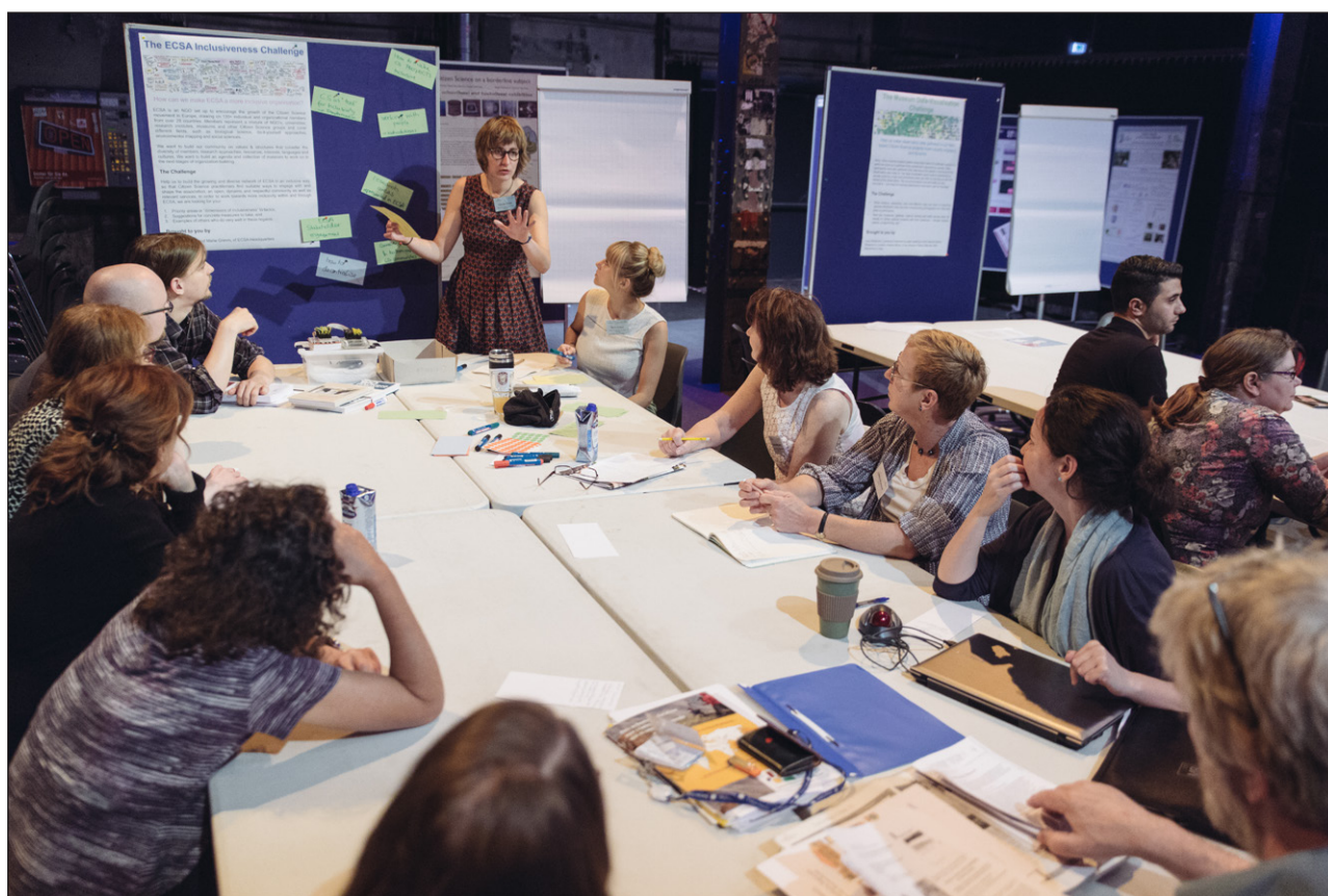
Participants engaged in breakout groups at the first international conference of the European Citizen Science Association— Citizen Science—Innovation in Open Science, Society and Policy —held in Berlin, Germany, May 2016.